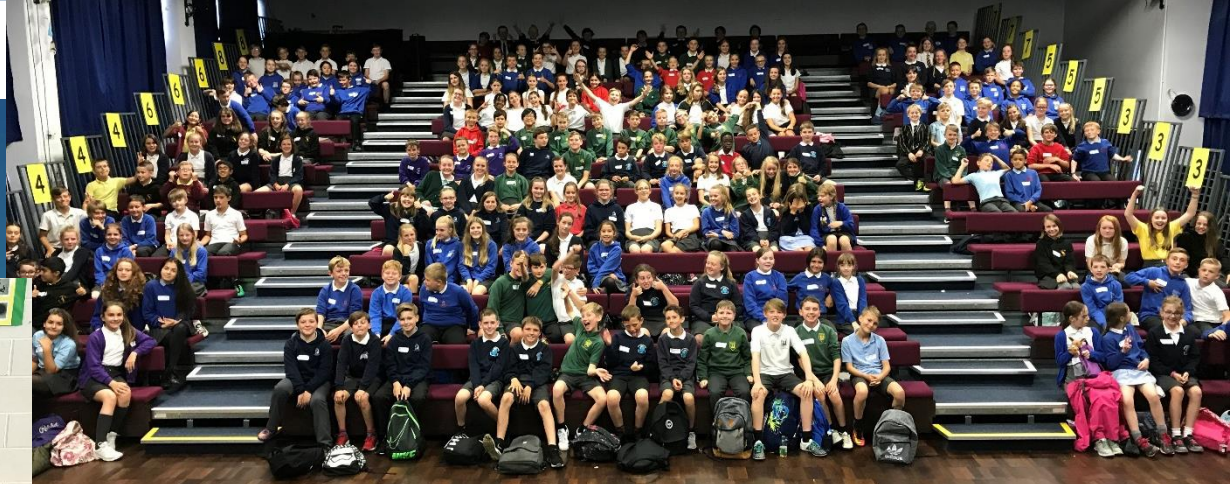
Year 6 Induction Day Timetable 10th July 2017